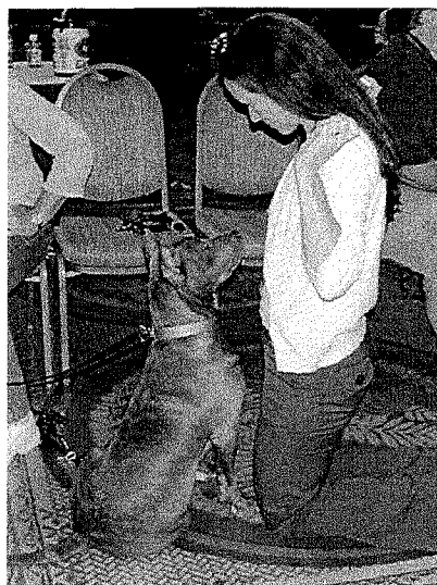
Teaching "sit" and "look" to a dog in laboratory class. Notice that the human moved closer and lower (by kneeling) to this dog to keep the dog focused on her. The dog is about to be given a treat which is enclosed in the human's left hand (a clicker is in the right hand).

"Bonnie—sit—(3-second pause)—sit—(3-second pause)—Bonnie, sit, look—(move closer to dog and move treat to your eye to encourage her to track the treat to your eye and "look")—sit—good girl! (treat)—stay—good girl—stay (take a step backward while saying "stay"—then stop)—stay Bonnie—good girl—stay (return while saying "stay"—then stop)—stay Bonnie—good girl (treat)—okay (the releaser and she can get up)!"