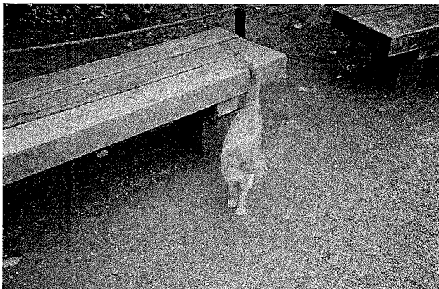
An intact male cat exhibiting all of the behaviors, as listed, that are involved in spraying. In addition, he is rubbing his tail base against the cedar bench. This cat did not spray.

Spraying of urine usually, but not always, follows these behaviors.