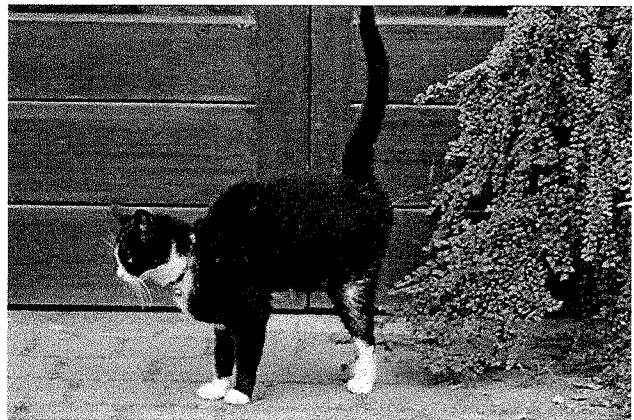
Cat spraying vegetation.

If you watch your cat it will be clear how important the sense of smell is to cats. Urine can be a currency of scent to cats and they use it to signal to each other. Because of this signaling, whenever spraying is involved it is absolutely critical that you work closely with your veterinarian to understand all the social relationships in the household, and in the vicinity of the houses where the cat lives. Chances are, spraying is a nonspecific sign of social disruption or distress and spraying will not resolve unless the social concerns are addressed. See the Protocol for Understanding and Treating Feline Aggressions with an Emphasis on Intercat Aggression for situations where addressing litterbox hygiene does not help.