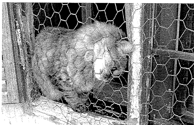
A cat rubbing her cheeks and whiskers across a metal screen, which leaves behind some waxy secretions and odor.

Cats will also rub the sides of their cheeks, the area in front of the ears, and their chin on corners of walls or furniture. You can learn if your cat has been doing this by looking at hallways, entrances, et cetera, at cat height—you’ll see the slightly waxy deposit. This behavior has created a market for “corner combs,” devices that can be attached to edges of walls and where cats can rub and groom their facial hair at the same time.