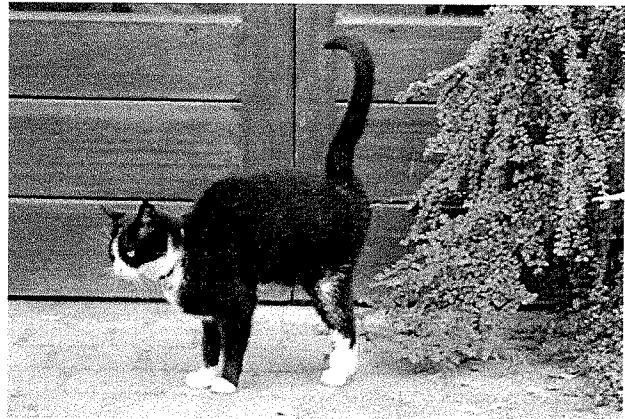
A cat spraying against a shrub outside his house.

Cats scratch objects for two main reasons: (a) to remove the layered sheaths that comprise their claws and (b) to leave visual and olfactory marks. Like spraying, the act of scratching is also a behavior that is very obvious and can be seen by any watching cats. Were cats given their choice, they would never have their claws and the end segment of their toes surgically removed —they would scratch in materials like tree